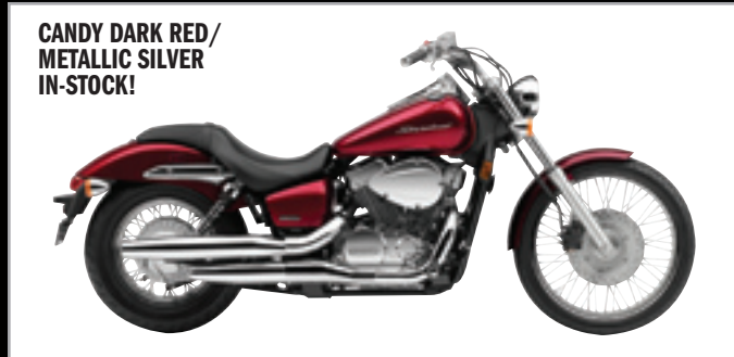
2009 SHADOW SPIRIT™ 750

CANDY DARK RED/ METALLIC SILVER IN-STOCK!