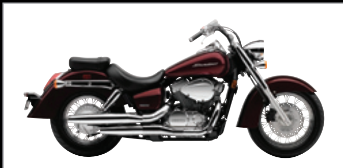
2009 SHADOW AERO®